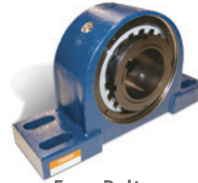
Four-Bolt Pillow Block