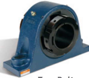
Two-Bolt Pillow Block

Choose the housing configuration that fits your need. For your convenience, Timken offers interchange solutions for hundreds of other housed units that simply don't offer the strength of these solid-block designs.